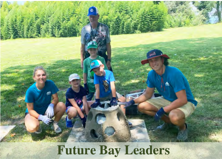
Future Bay Leaders