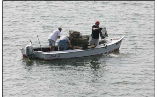
Marylanders Grow Oysters plantings on June 11-15, 2010.

Next year's program begins on September 18, 2010. From 8 a.m. until noon at St. Mary's College, we will distribute 300,000 spat-on-shell in 650 cages to more than 100 volunteer homeowners. If you are signed on, please pick up your cages. If you have not signed on, call us and become a part of Marylanders Grow Oysters. 301-862-3517