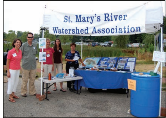
SMRWA at the River Concert Series