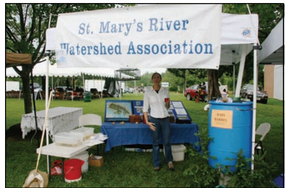
SMRWA at the Juneteenth Festival